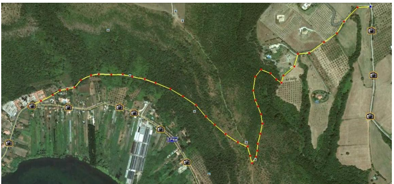
SENTIERO NATURA SAN BERNARDINO DEL MALPASSO