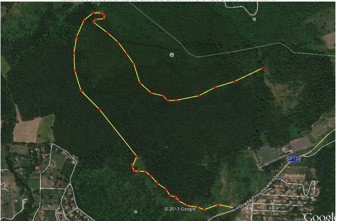
SENTIERO NATURA ROCCA ROMANA