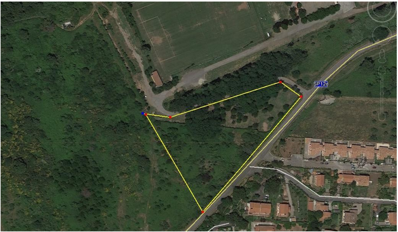
AREA SOTTOSTANTE IL CAMPO SPORTIVO IN LOC. SAN MARTINO